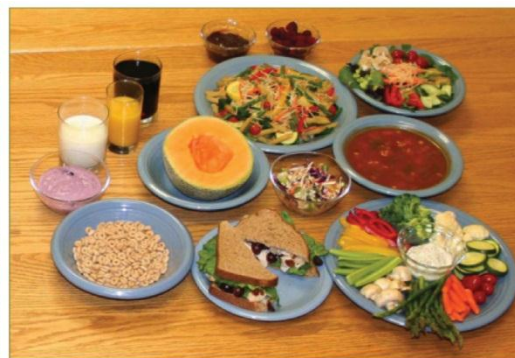
1575 Kcal Low Energy Density